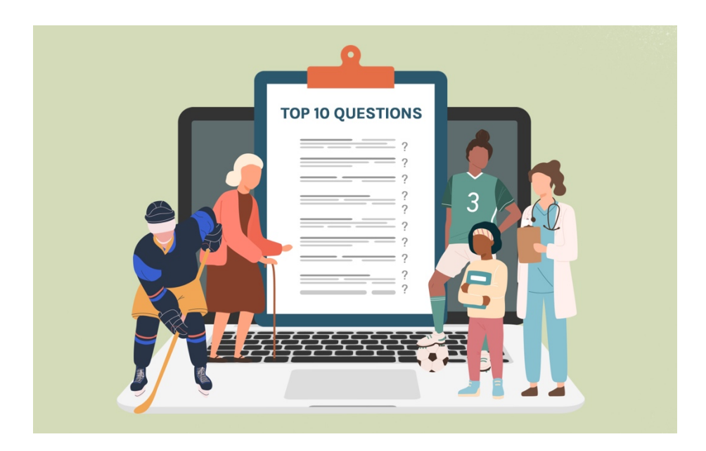
Top 10 Clipboard Image (English and French)